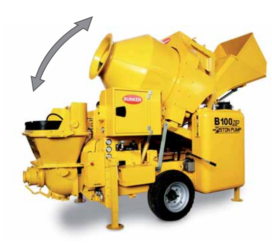
Electric vibrator on the hopper grid