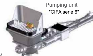
Pumping unit "CIFA serie 6"