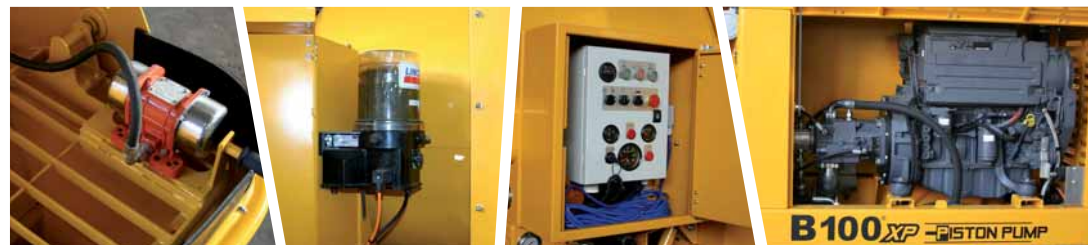
Diesel engine Deutz